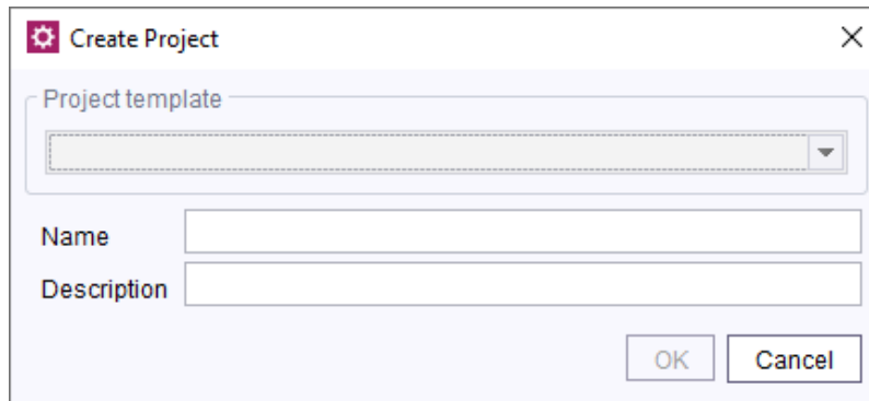
Project – Create from template

When creating a new project the Project template field is only displayed if project templates are also stored on the FirstSpirit server. The project templates stored there are offered for selection in a drop-down input component.