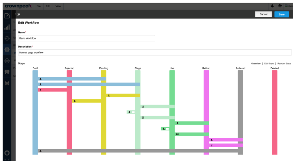
Figure 2 – Expanded Workflow